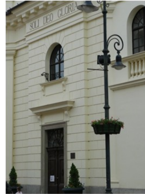
Soli Deo Gloria, Mynska Street Church, Kosice