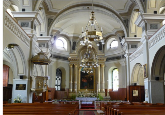
Presov, Slovakia- Slovak Lutheran Church, Diocese